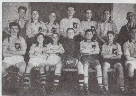
1954 'ish, Hall 1956, Charmouth