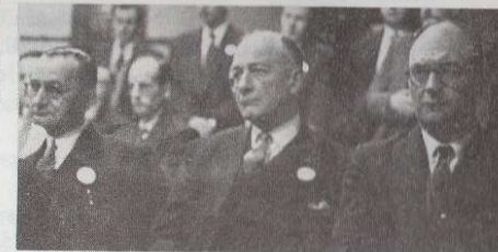
70th men at 50th Year Dinner. Dec. 1958