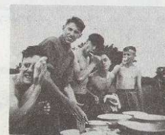
Any year.... any Camp!