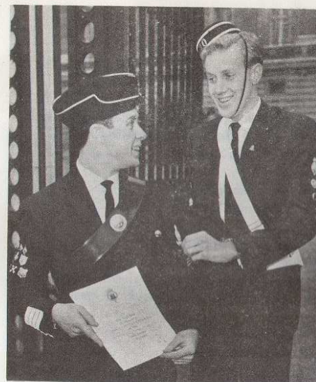
1961 Buckingham Palace